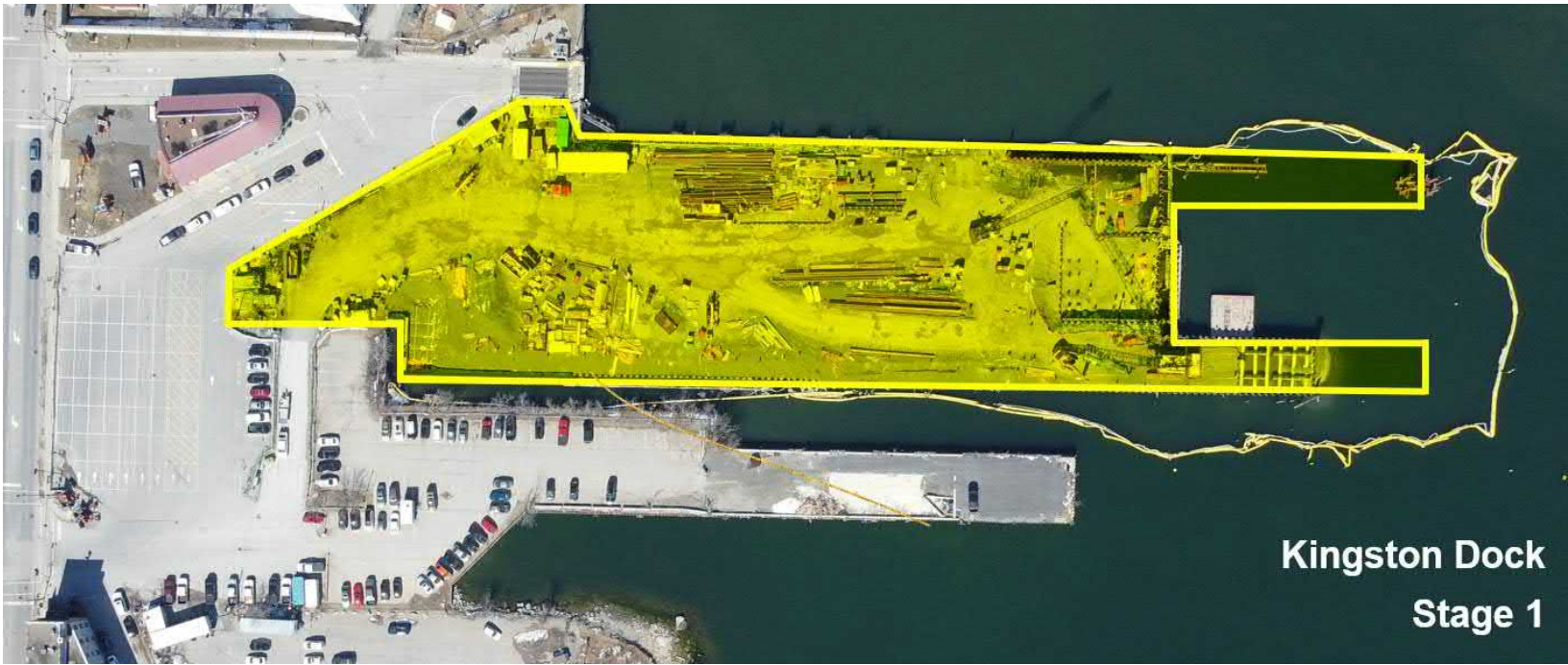
Kingston Dock Stage 1