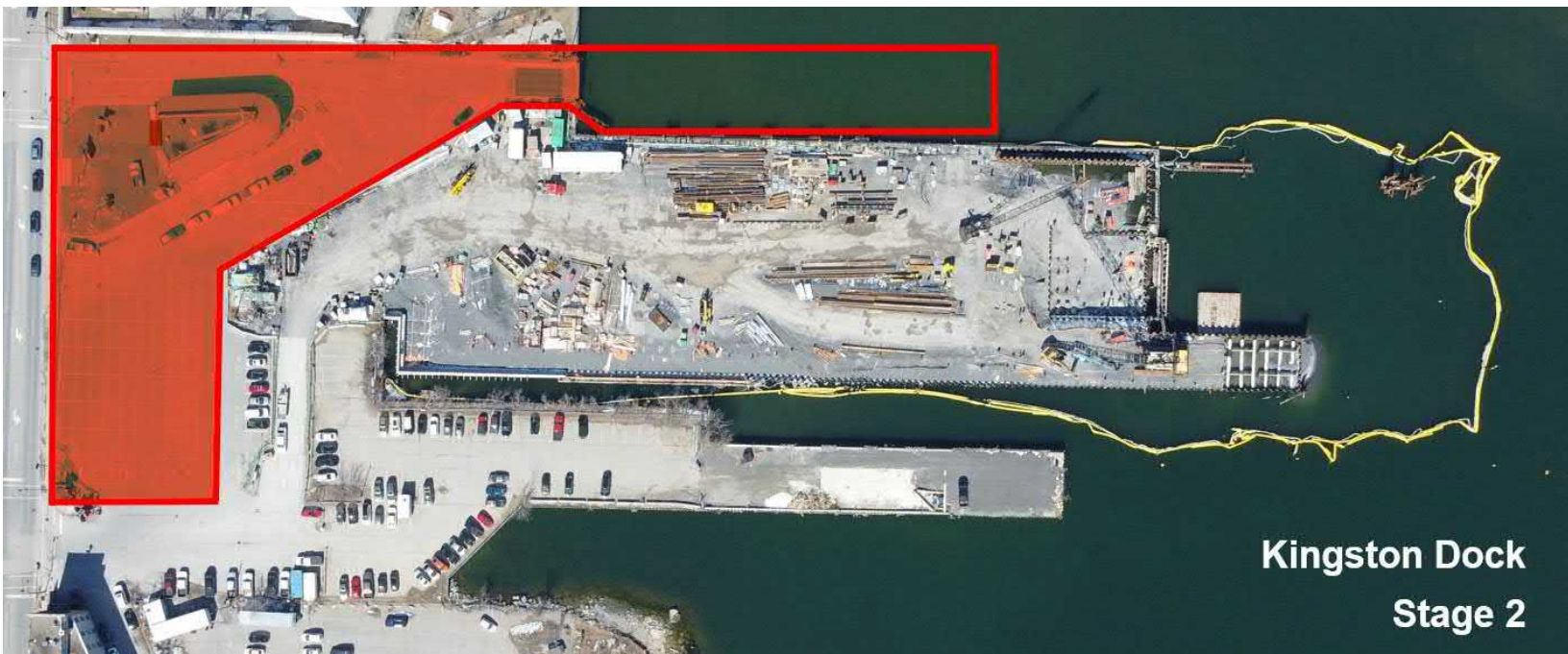
Kingston Dock Stage 2